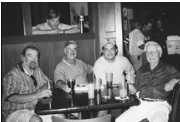
CAPTAIN'S MEETING STRATEGY QUARTET (NOTE THE EAVESDROPPER)