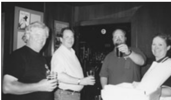
INTERMISSION AT THE CAPTAIN'S MEETING