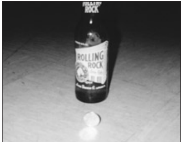
IS THIS A MAGIC COIN? YOU DECIDE.

It was Tuesday August 28th. The occasion was the Tournament of Champions. Many a fine darter had assembled at Legion Post #1. The mood was festive as friends caught up with news of the summers events, and dusted off their darts from what, for many, had been months of neglect. Things were moving along as usual, everyone appeared to be having a good time. Then a strange thing occurred. Someone pulled a gold coin from their pocket to flip for the diddle. It sailed through the air, end over end. But when it landed, it was neither heads nor tails. There it sat, on edge for all to see. Was it a trick? Had we slipped into the Twilight Zone? Where was Mr. Ripley? Believe it... or not! ●