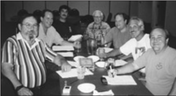
BOARD MEMBERS AT THE SEPTEMBER 2001 MEETING (HARD AT WORK) OH YEAH!