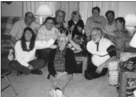
CAN YOU NAME ALL THESE DARTERS?