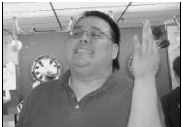
EUGENE SEEMS TO BE HAVING FUN