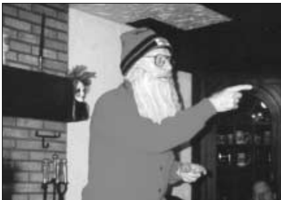
A LITTLE CHRISTMAS SPIRIT