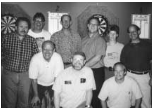
CLASSIC B HOT SHOTS - STRAIGHT ARROWS AND FREE RANGE POTATOES - 9/10/02, MINNEHAHA LANES

Congratulations to the winners, as well as to all who participated. Everyone there was already a winner by taking their league teams to a 1st or 2nd place finish in their League Divisions. Hope to see lots of you at this Tourney in 2003. ●